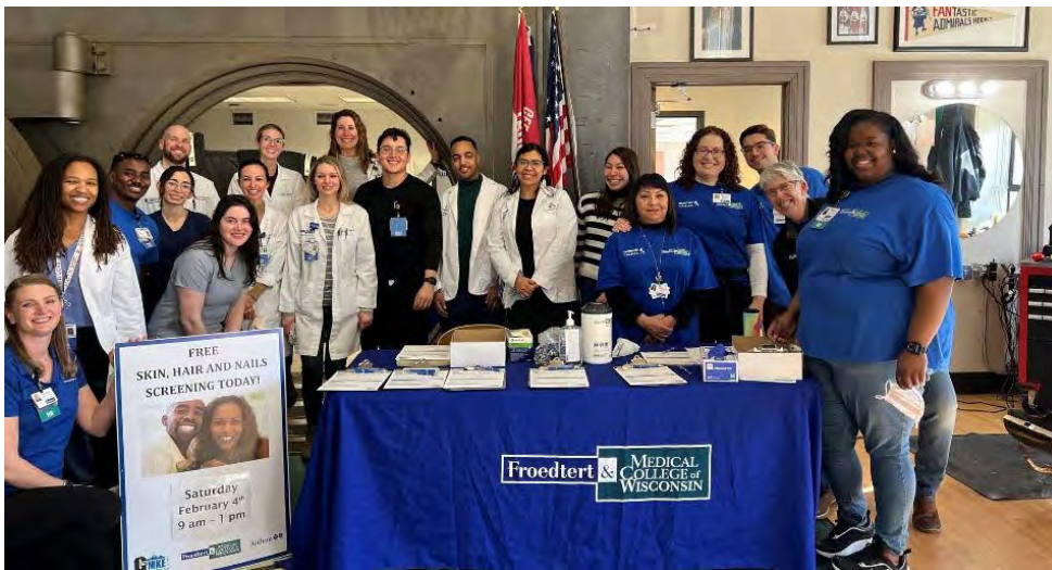
Froedtert & MCW staff, including Spanish medical interpreters, at the free skin, hair and nails event.