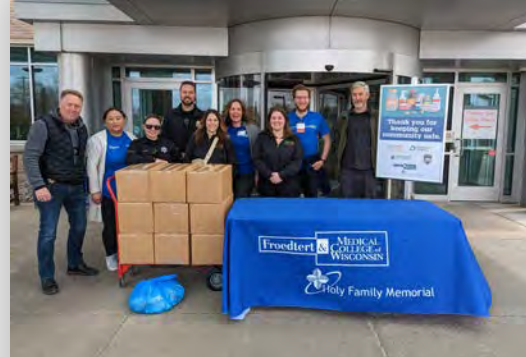
Staff volunteer at the Froedtert Holy Family Memorial Hospital drug take back event.