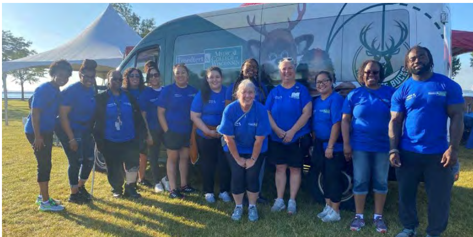
Froedtert & MCW staff at the UNCF Walk for Education—Milwaukee.