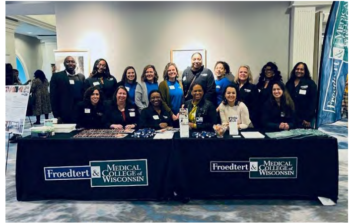
Froedtert & MCW staff at the Black Birth Symposium on March 25, 2023.

A resource fair was held at the end of the school year where families received health education and screenings and were connected with primary care clinicians. The Homework Diners and resource fair connect students and their families with education and resources to promote a healthier future.