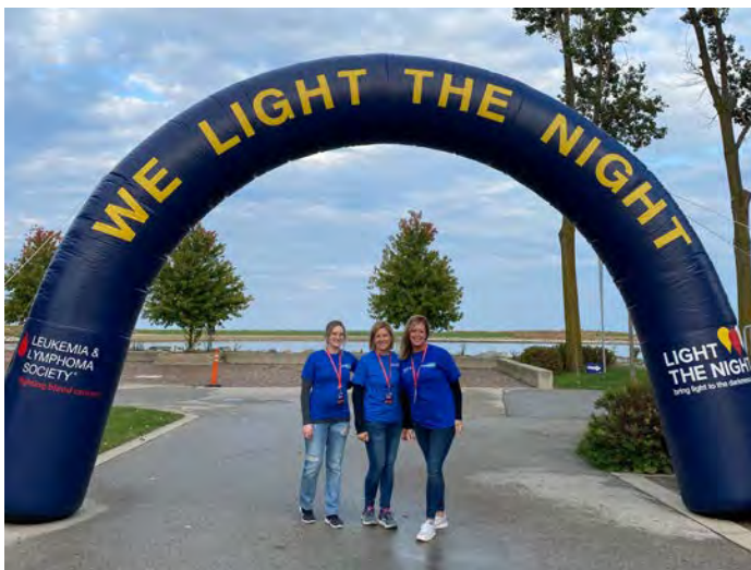
Staff volunteer at the Leukemia & Lymphoma Society's "Light The Night" event, one community event sponsored by our health network.

More than 100 organizations received funding through our health network's charitable giving and sponsorship programs.