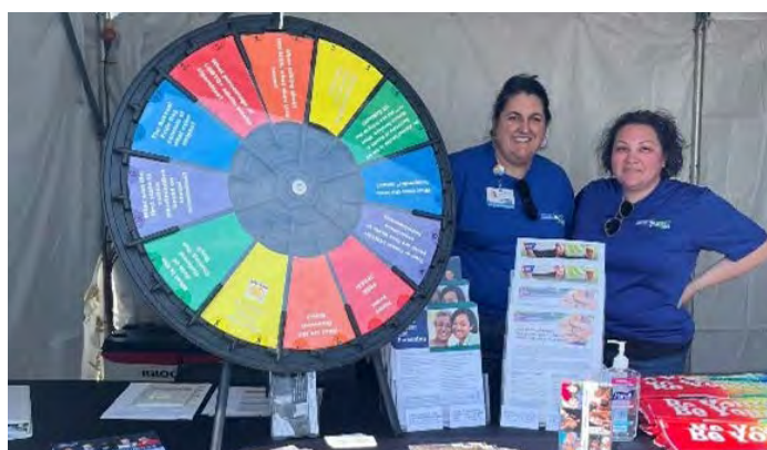
Froedtert & MCW staff share LGBTQ+ health care resources.