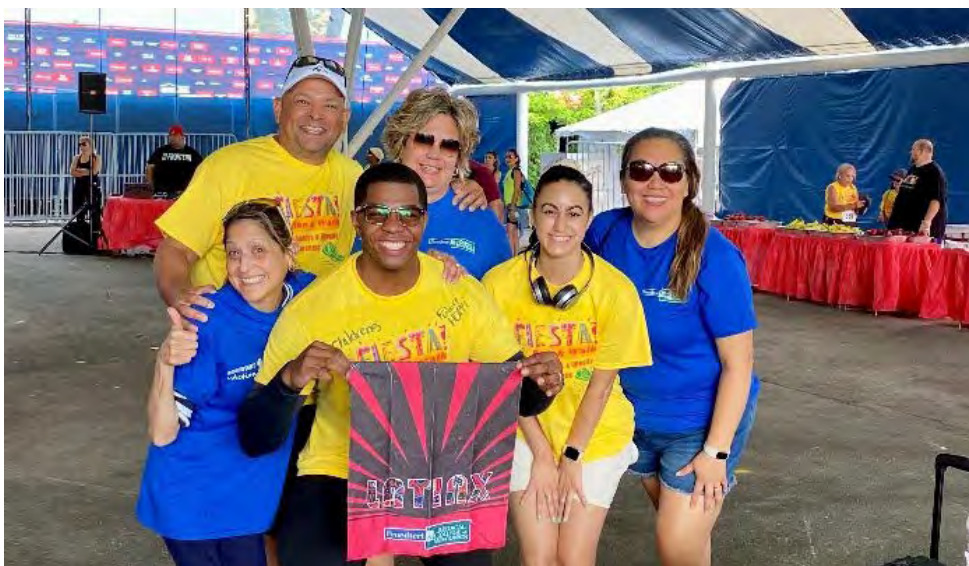
Froedtert & MCW health network staff volunteer at Mexican Fiesta.

Our sponsorship of the UNCF National Walk for Education—Milwaukee event is part of our commitment to stay connected to the diverse communities we serve through outreach efforts and partnerships.