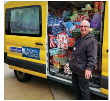
Holiday gifts ready to be delivered to local families