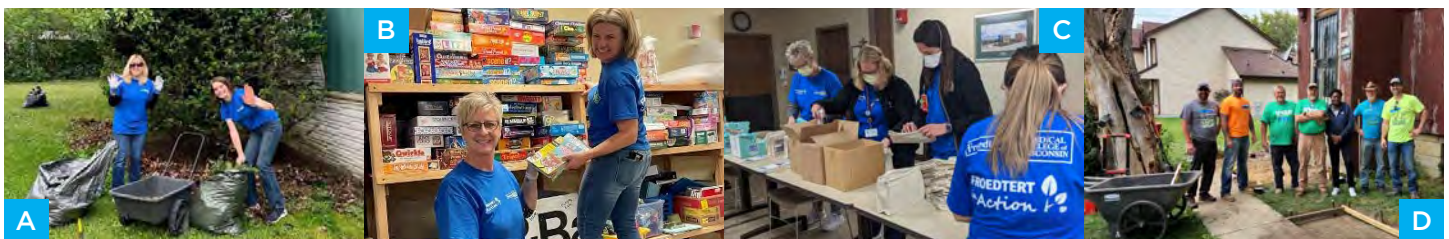
A. 257 staff volunteered 880 hours to provide spring and fall clean-up tasks in 84 yards. B. More than 50 staff completed projects with 11 organizations that support women, children and families on Oct. 11, International Day of the Girl. C. Staff filled 1,240 hygiene kits that were donated to local organizations as part of our annual United Way staff giving campaign. D. Each year, our health network sponsors Revitalize Milwaukee's Block Build, a summer weekend event that provides free home repairs throughout Milwaukee and Waukesha Counties to help homeowners stay in their homes and stabilize neighborhoods.

Froedtert in Action, a Community Engagement initiative, reaffirms our organization's commitment to give back to the diverse communities we serve. It reflects our commitment to our mission while creating excitement about the many ways we can give back as an organization. The program highlights volunteer opportunities available to staff, showcases the value of those community activities and demonstrates the impact of the work we do.