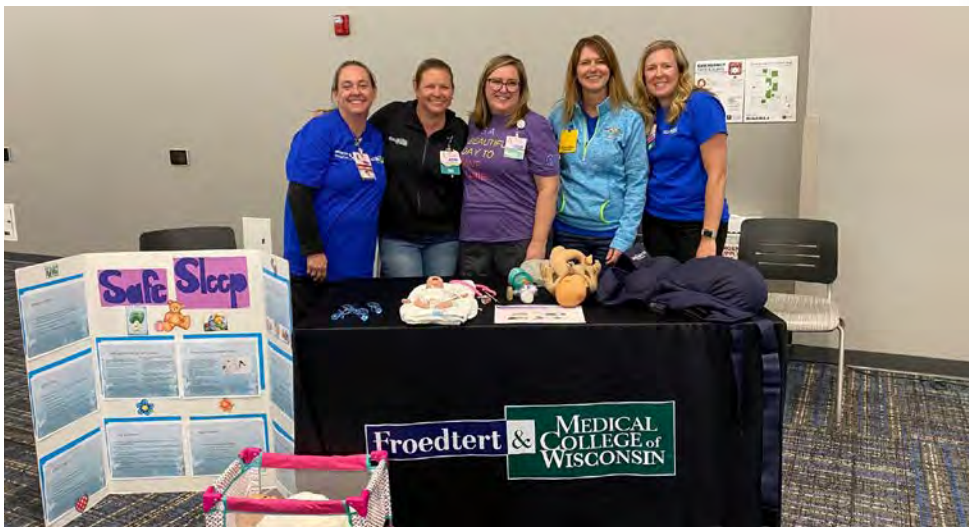
Staff participates in a high school health care career fair.