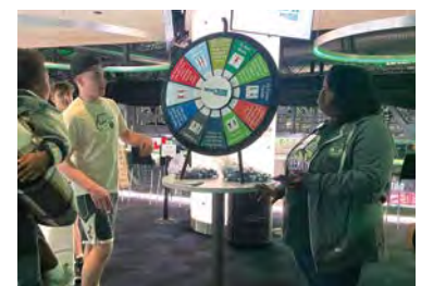
Los Bucks Noche Latina and Pride Night games and BUCKSFit event