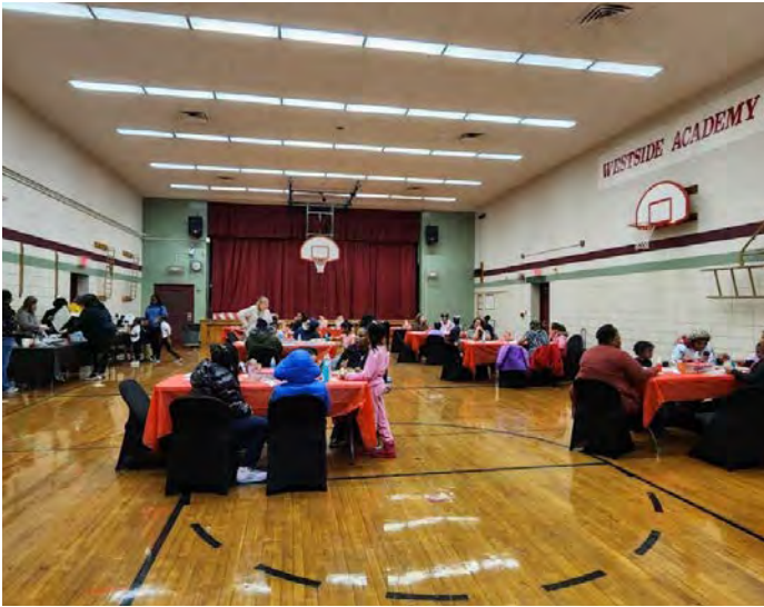
Students and their families enjoy a meal at a Westside Academy Homework Diner.