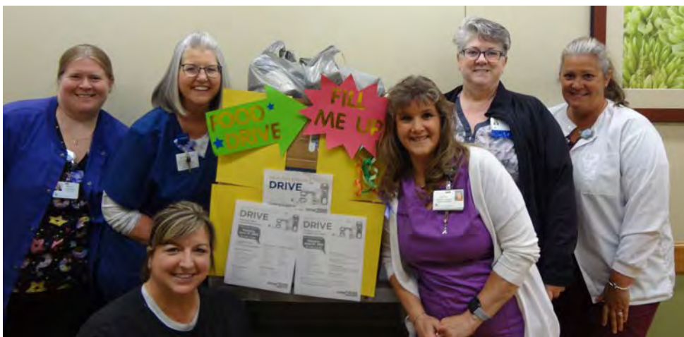
Cancer Center staff collects items for the Healthy Shelves Drive.