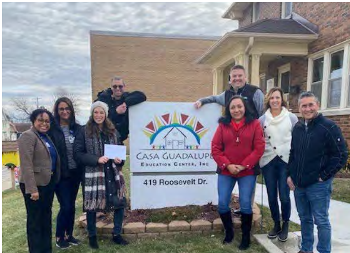
Healthy Community Fund grant recipient Casa Guadalupe Education Center, Inc.

The Froedtert & the Medical College of Wisconsin health network integrates Corporate Social Responsibility practices and programs and volunteer opportunities through Froedtert in Action into our culture.