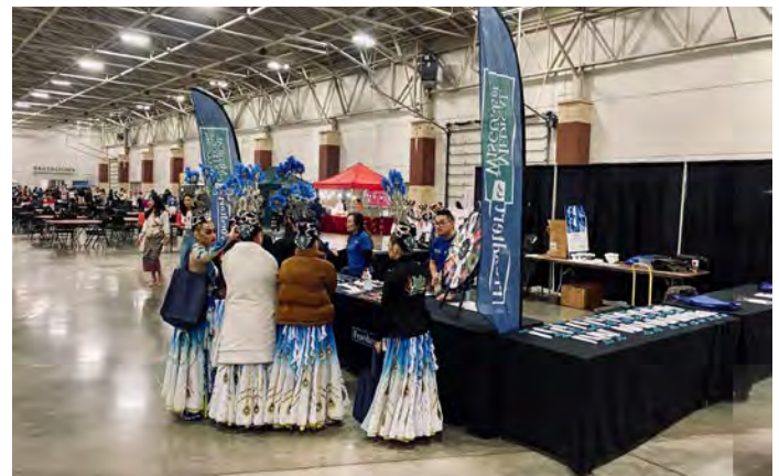
Milwaukee Hmong New Year celebration