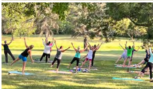
Yoga classes in Menomonee Falls and Manitowoc