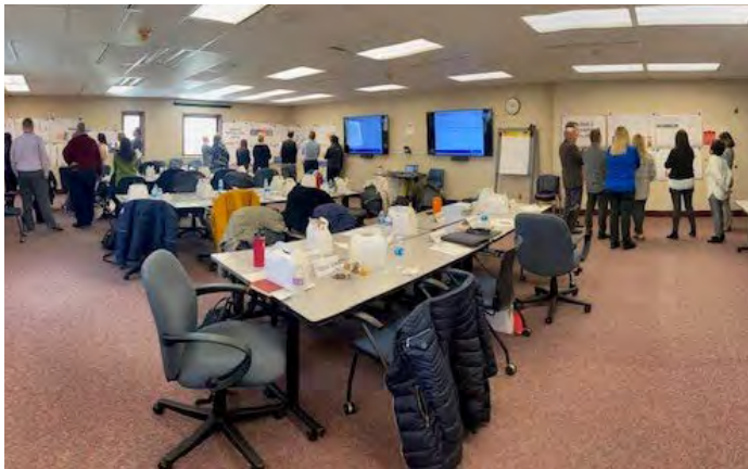
Froedtert West Bend Hospital Community Health Needs Assessment session.

The Froedtert & the Medical College of Wisconsin health network is committed to being an Anchor Institution and making a positive impact on our community's health and safety.