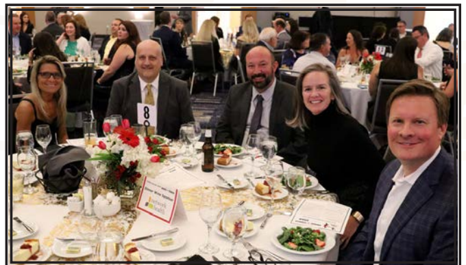
Guests from Ryan Companies US, Inc. enjoy one another's company and the event.

SAVE THE DATE FOR THE 2024 SPRING SPLENDOR GALA: FRIDAY, APRIL 19, 2024