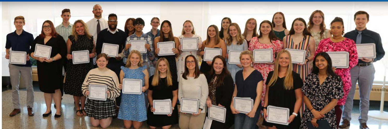
2023 Scholarship Recipients