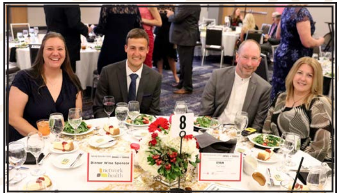
Guests socialized during the meal and before the Live Auction.